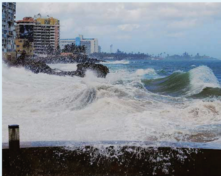
Storm surge in San Juan.

The changing climate is also likely to increase inland flooding. Since 1958, rainfall during heavy storms has increased by 33 percent in Puerto Rico, and the trend toward increasingly heavy rainstorms is likely to continue. More intense rainstorms can increase flooding as inland rivers overtop their banks more frequently, and more water accumulates in low-lying areas that drain slowly.